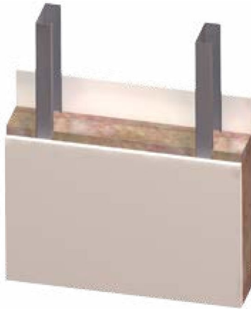
Partition Type 2