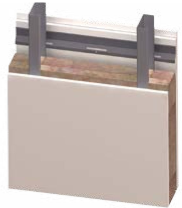
Partition Type 4