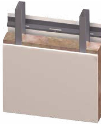
Partition Type 3